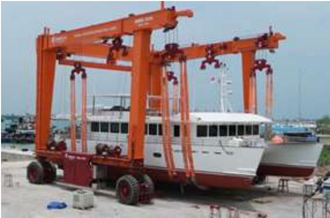
Mobile Boat Hauler Capacity 300 Ton with maximum width 13 meter