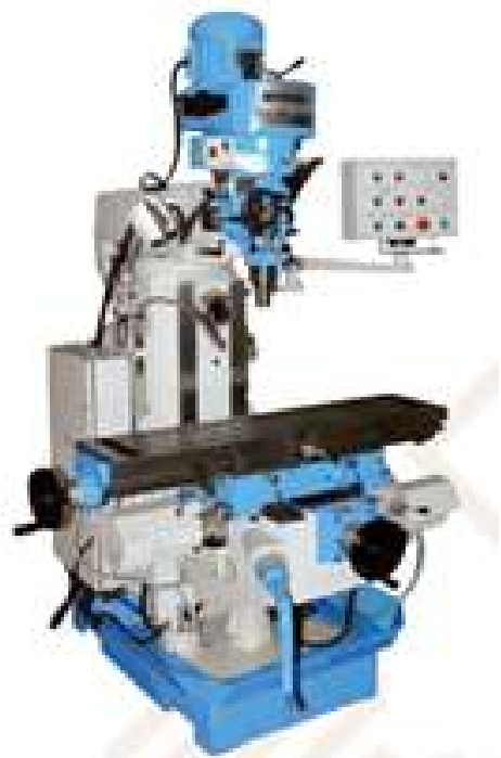
Universal Milling Machine