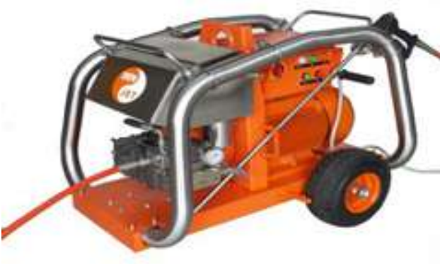
High Pressure Water Blaster 500 bar and High Pressure Water Blaster 180 bar