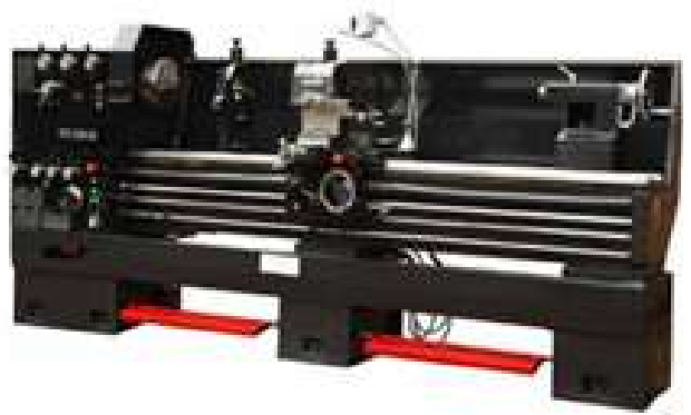
2 and 6 Meter Lathe Machines