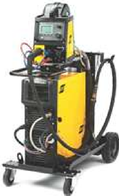
MIG Welding Machines