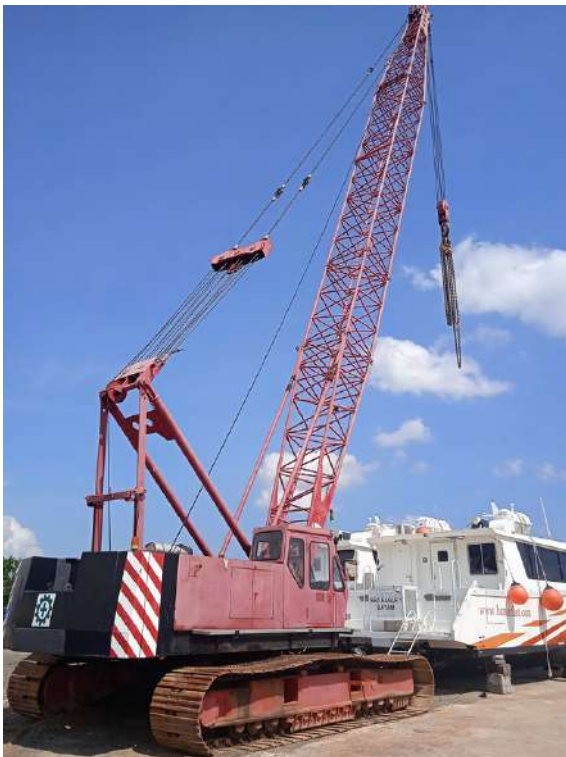
50 T Crawler Crane